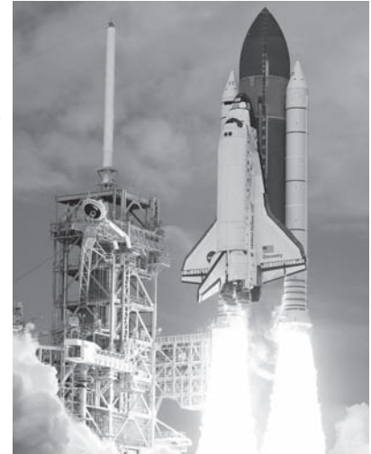
Space Shuttle Discovery

A space shuttle is a reusable spacecraft. It is launched into space by rockets, but lands like an airplane when it returns. Because it is reusable, the parts can be collected to be part of future missions. Only six orbital vehicles (the white, plane-shaped part) have been built.